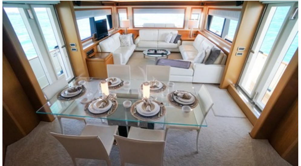
Salon and dining