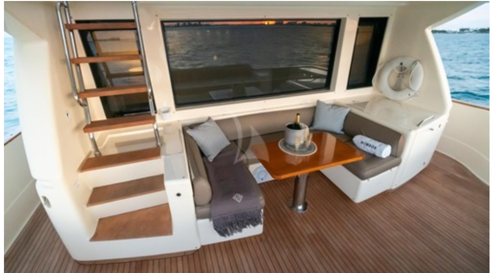
Main aft deck