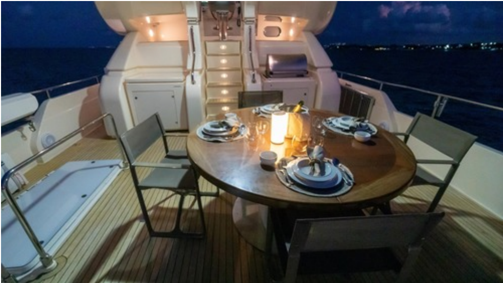
Upper aft deck