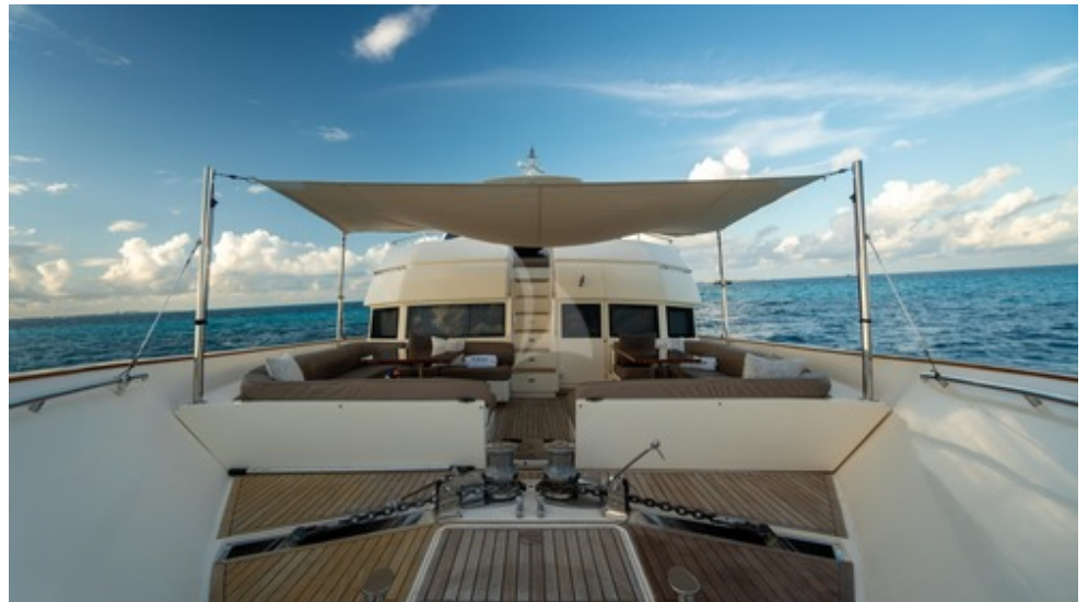
Foredeck with shade