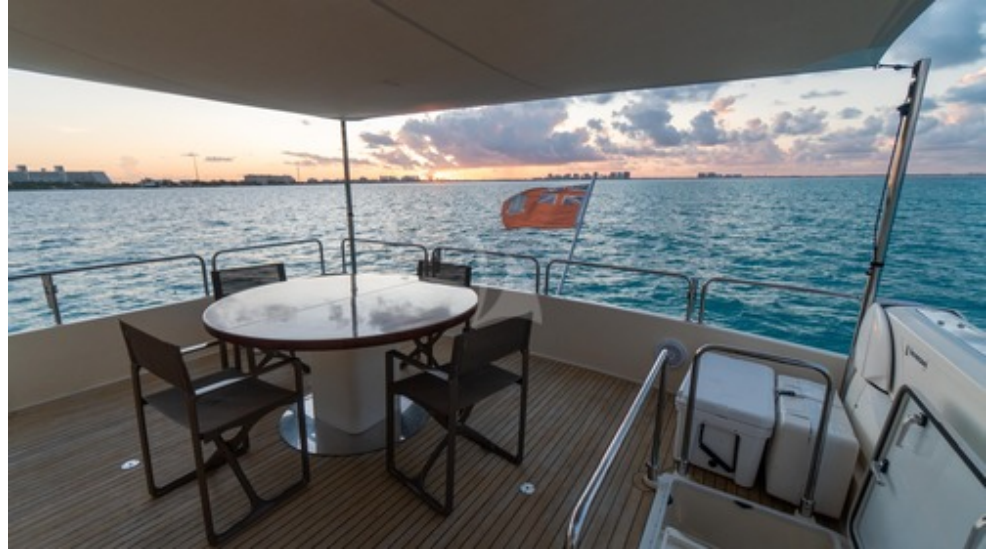
Upper aft deck