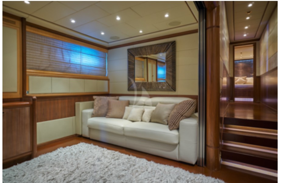
Lower Deck Living Space convertible to Double Bed