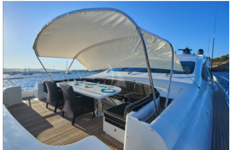
Foredeck Alfresco Area