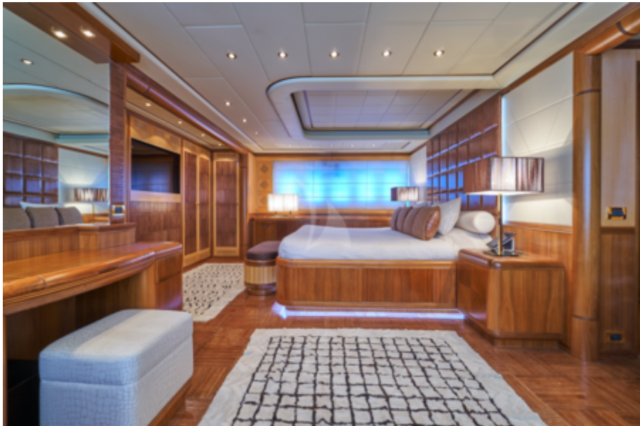
Master Cabin picture 2