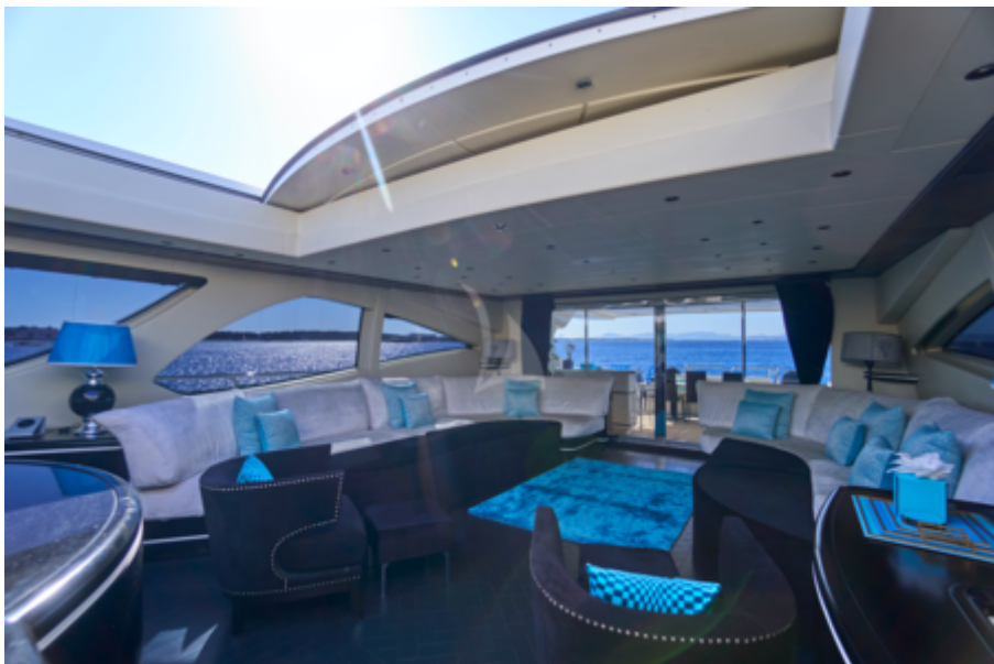
Living Room with Open Hard Top 1