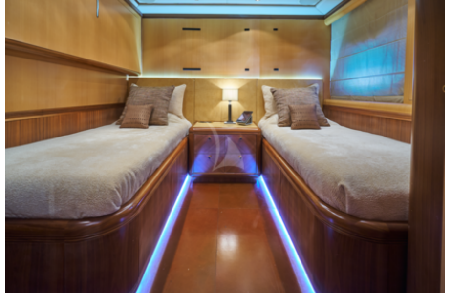
Twin Cabin with Pullman