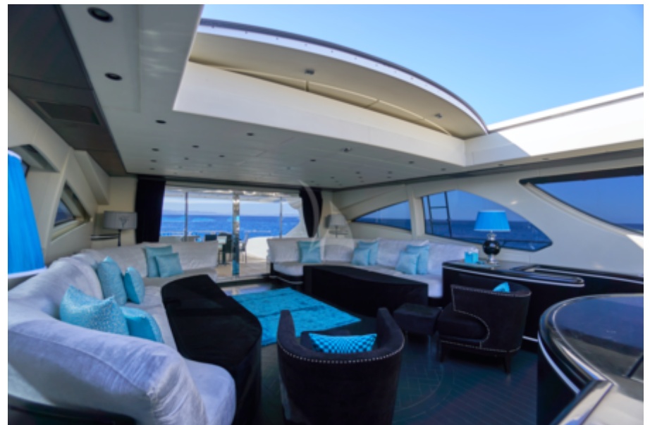
Living Room with Open Hard Top 2