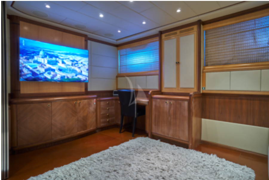
Lower Deck Living Space