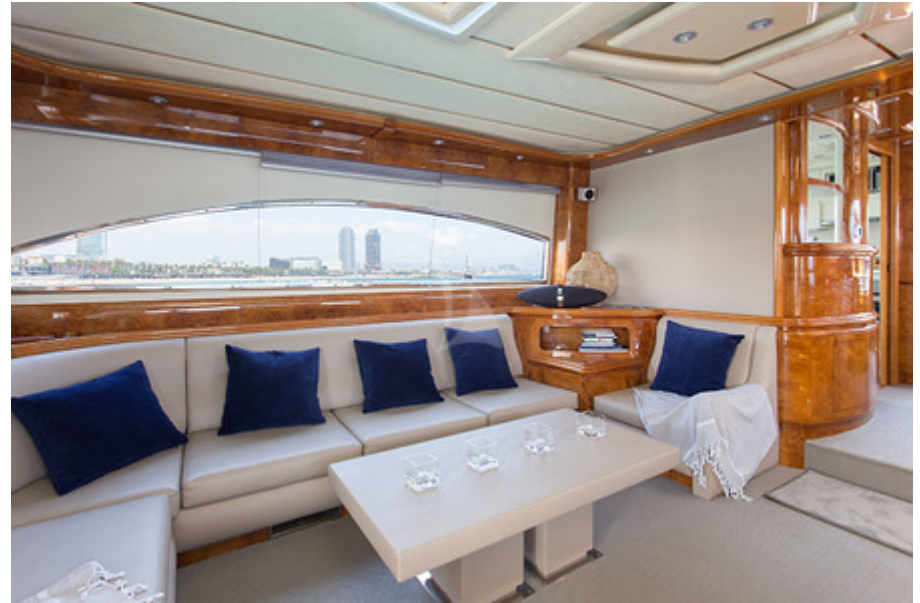
DOLCE VITA - Main salon table n°1