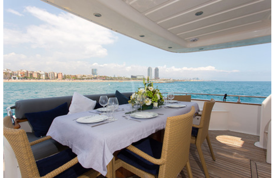
DOLCE VITA - Aft deck table