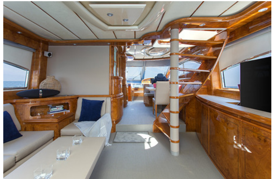
DOLCE VITA - Main salon