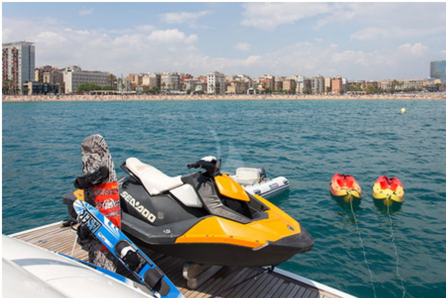
DOLCE VITA - Toys