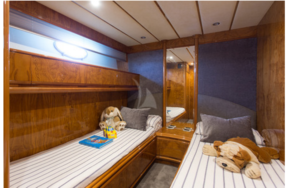
DOLCE VITA - Twin cabin n°1