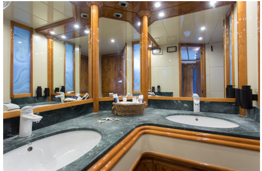
DOLCE VITA - Master cabin bathroom