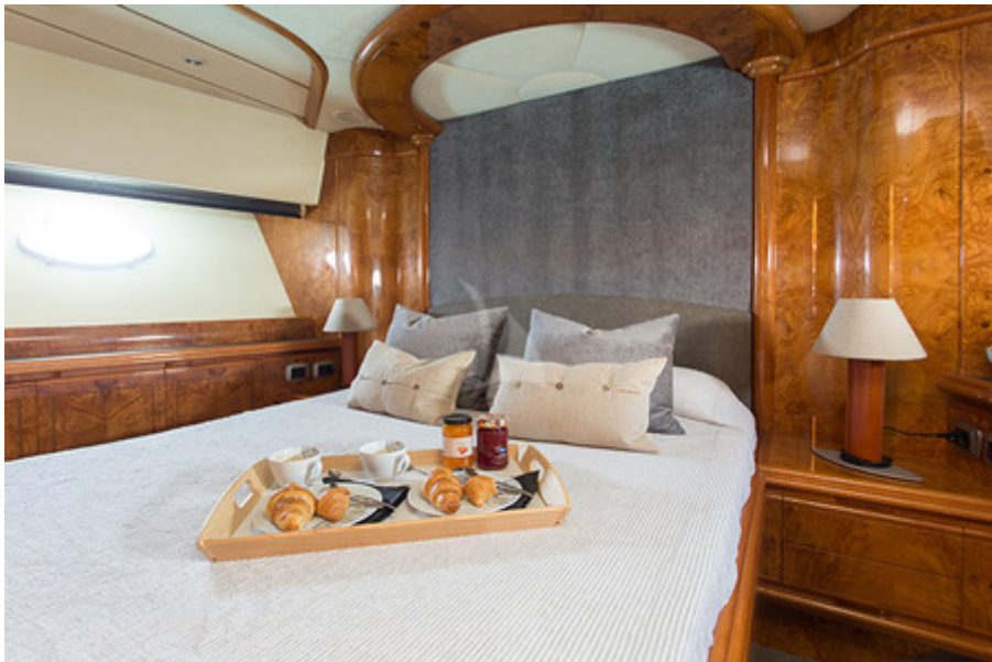
DOLCE VITA - VIP cabin