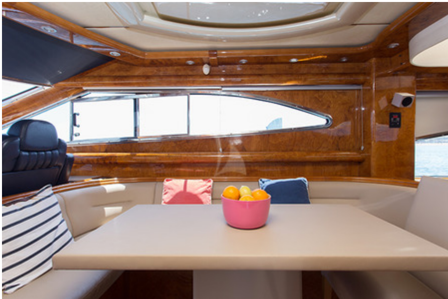
DOLCE VITA - Main salon table n°2