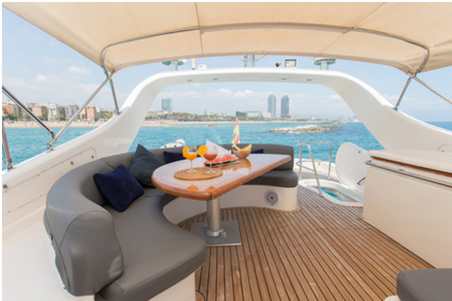
DOLCE VITA - Flybridge