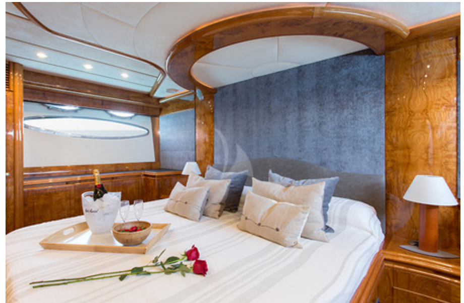
DOLCE VITA - Master cabin