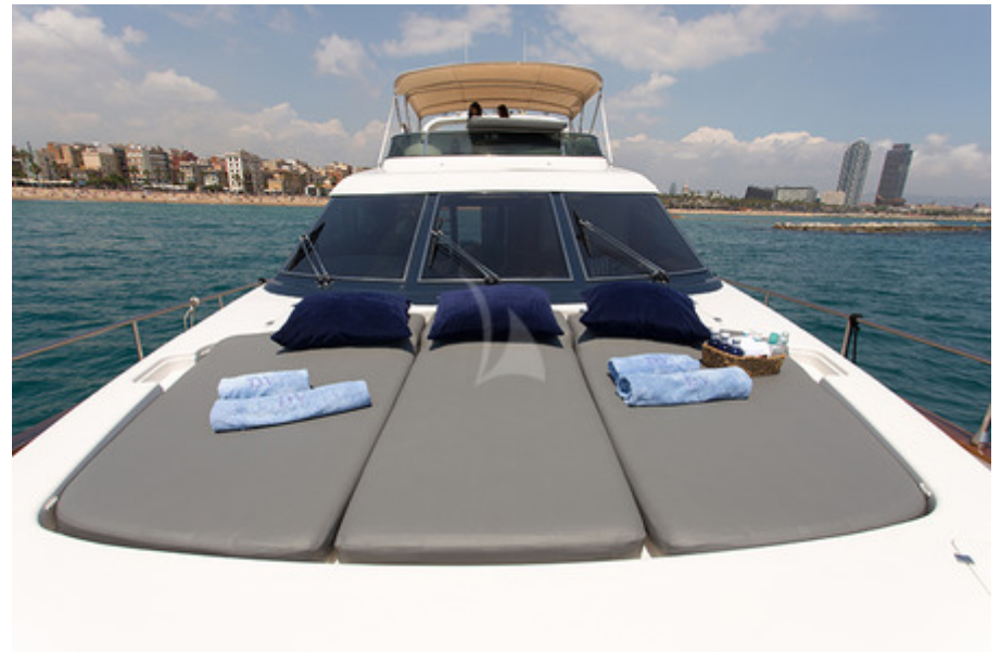
DOLCE VITA - Sunbathing area