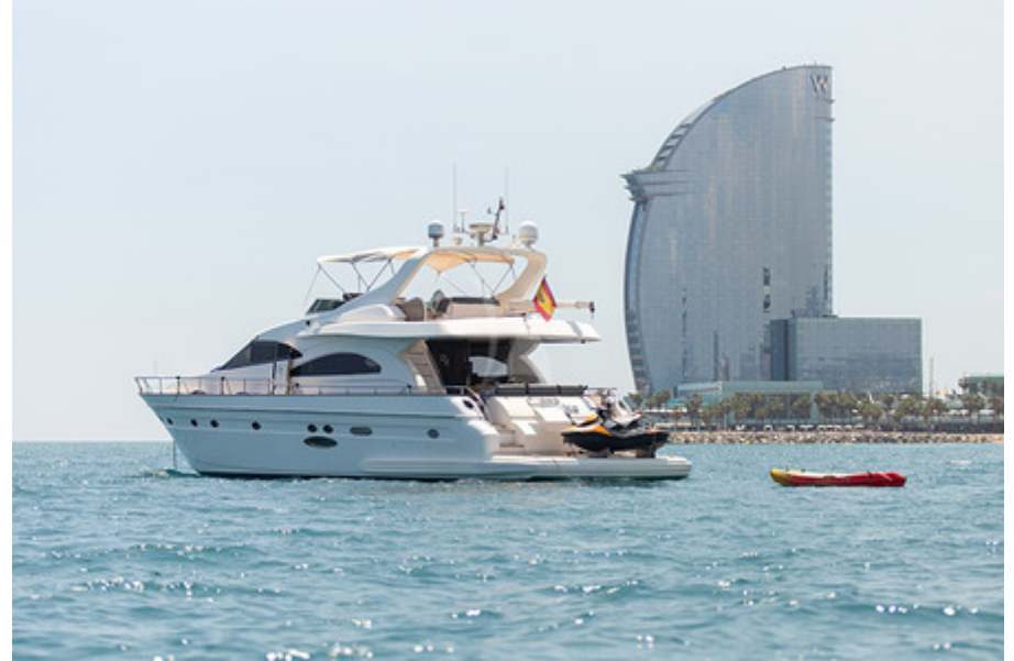
DOLCE VITA - At anchor