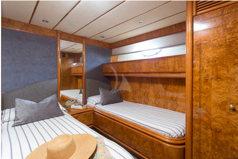
DOLCE VITA - Twin cabin n°2