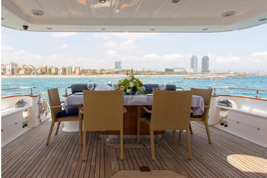
DOLCE VITA - Aft deck table