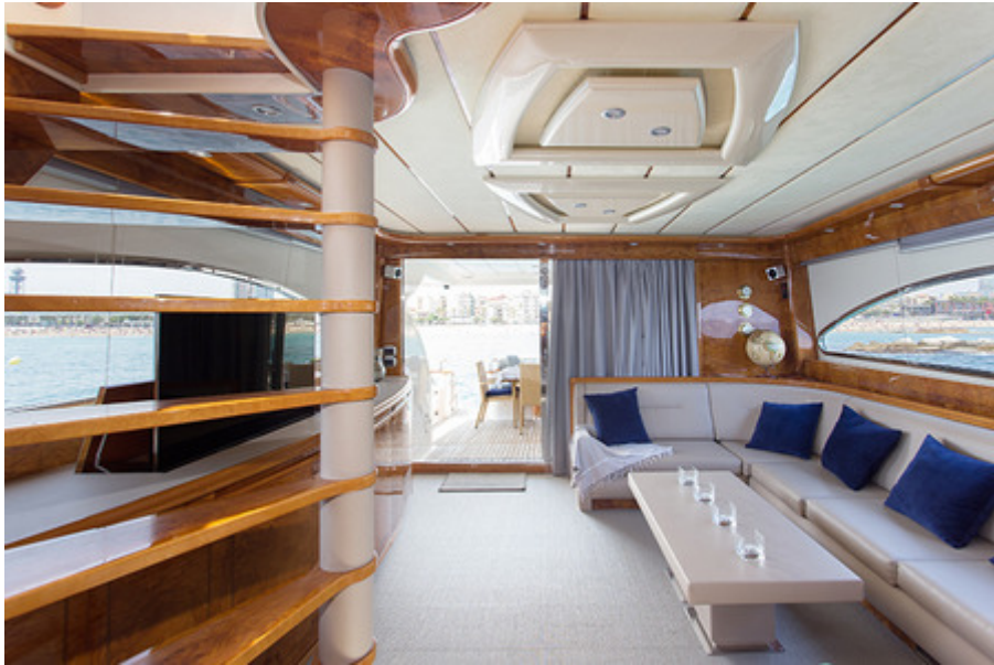
DOLCE VITA - Main salon