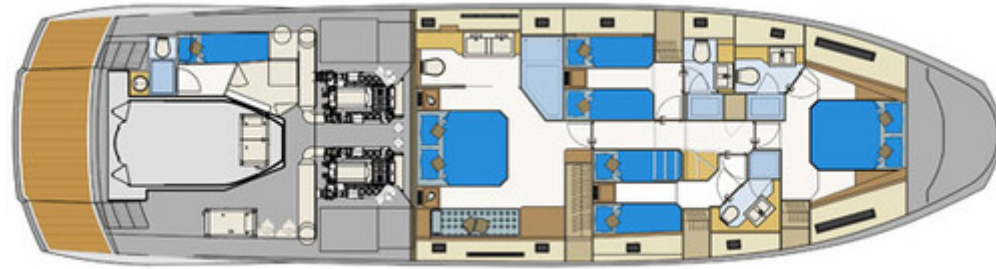
DOLCE VITA - Layout