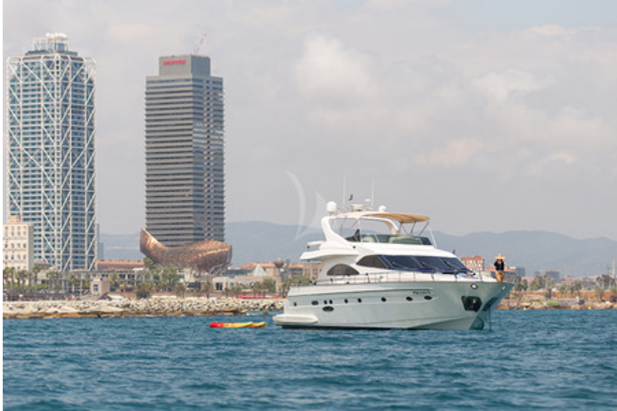
DOLCE VITA - At anchor