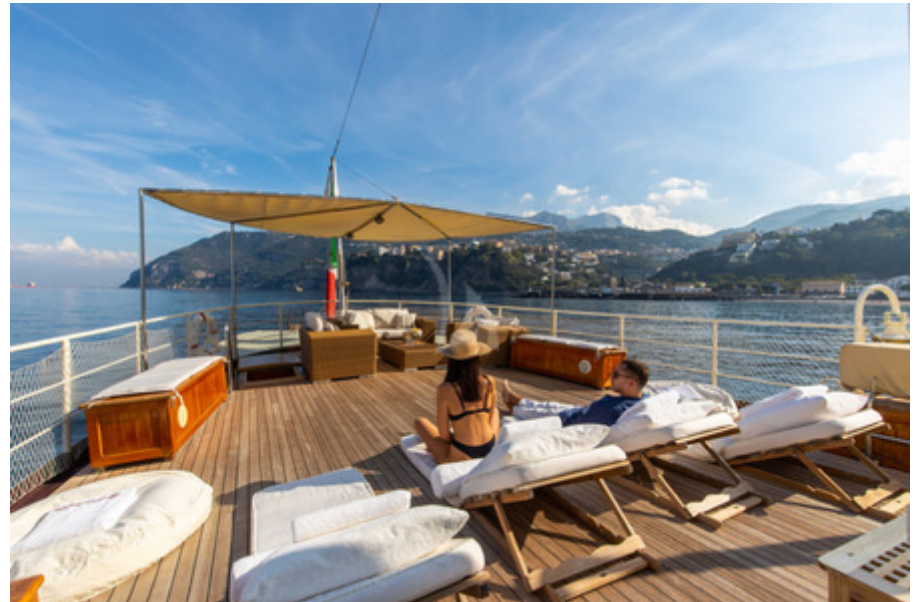
Solarium lounge area