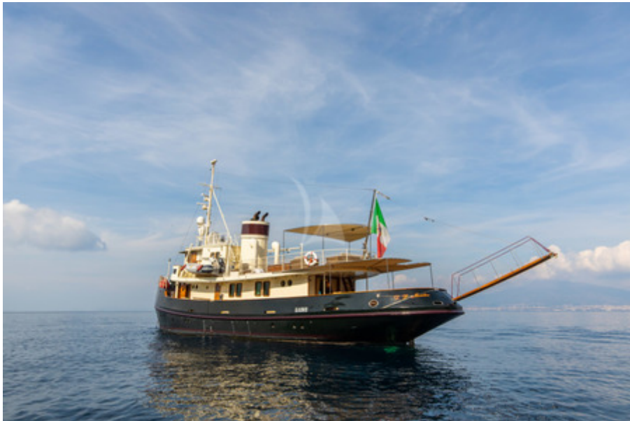
M/Y Dp Monitor