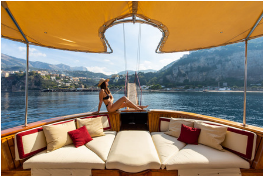
Aft deck sofa