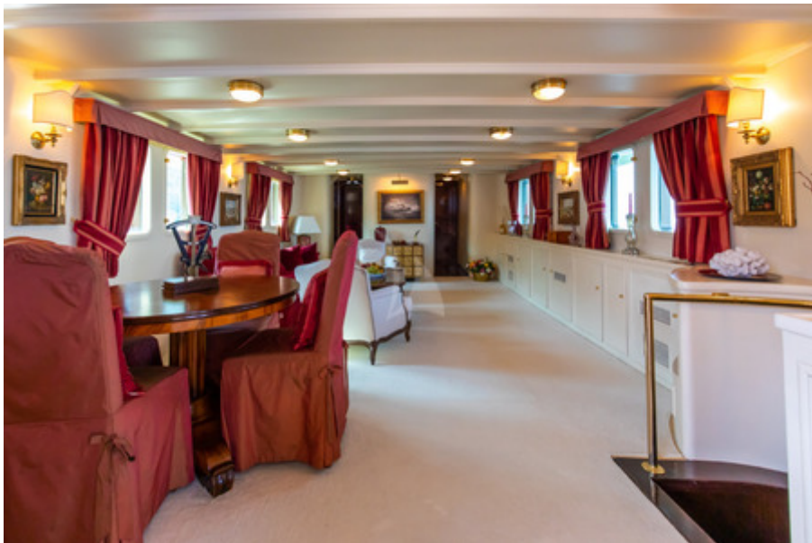
Interior salon area