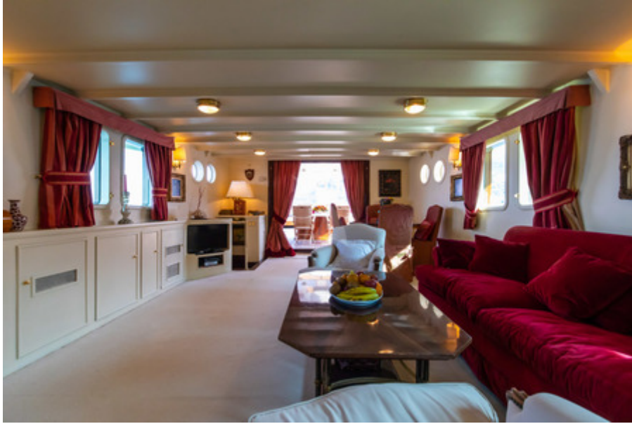
Interior salon area