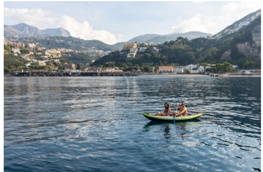
Kayak x 2