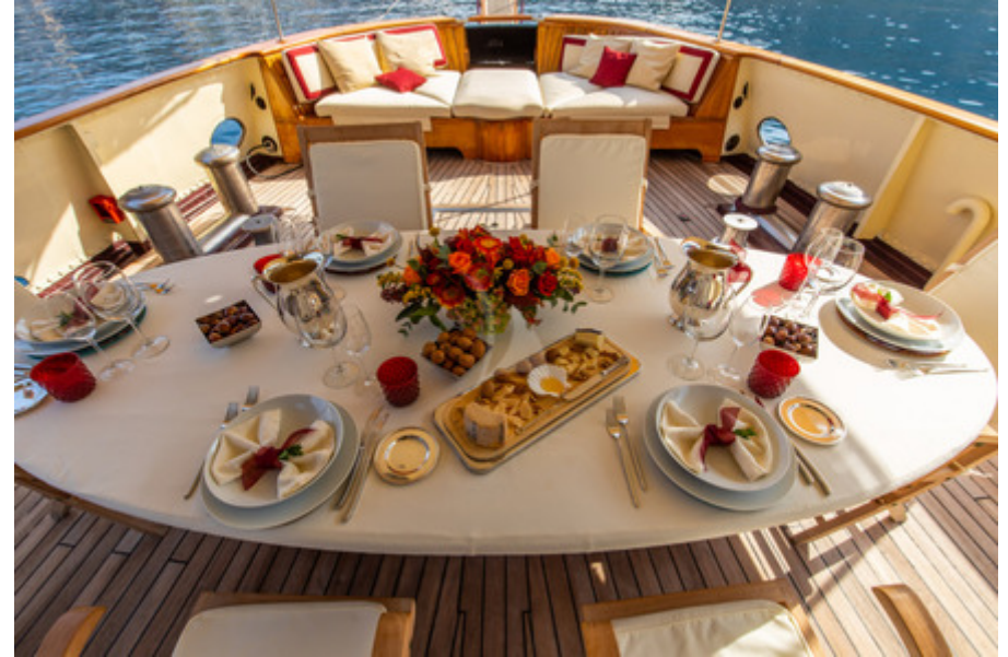
Al fresco dining table