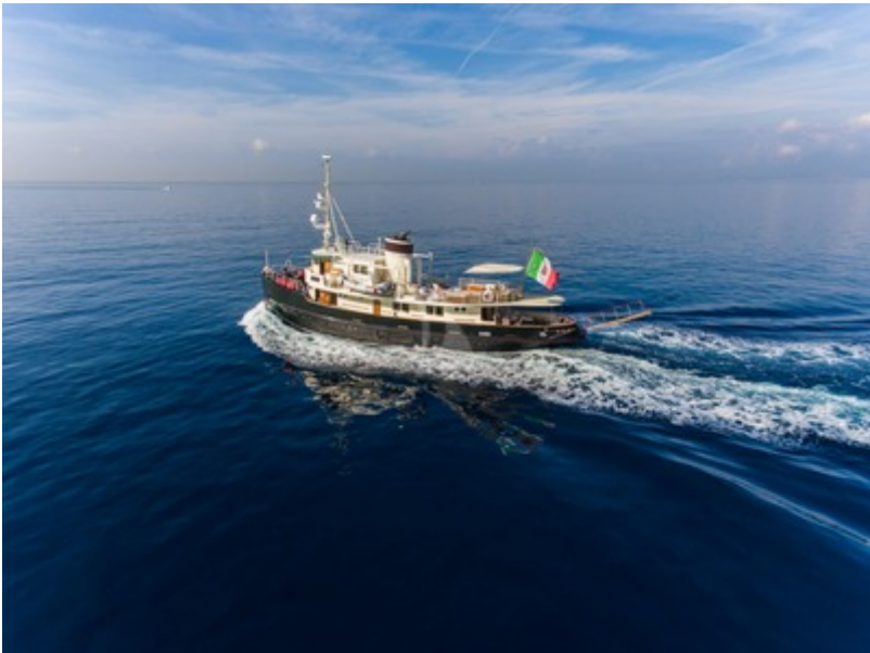
M/Y Dp Monitor