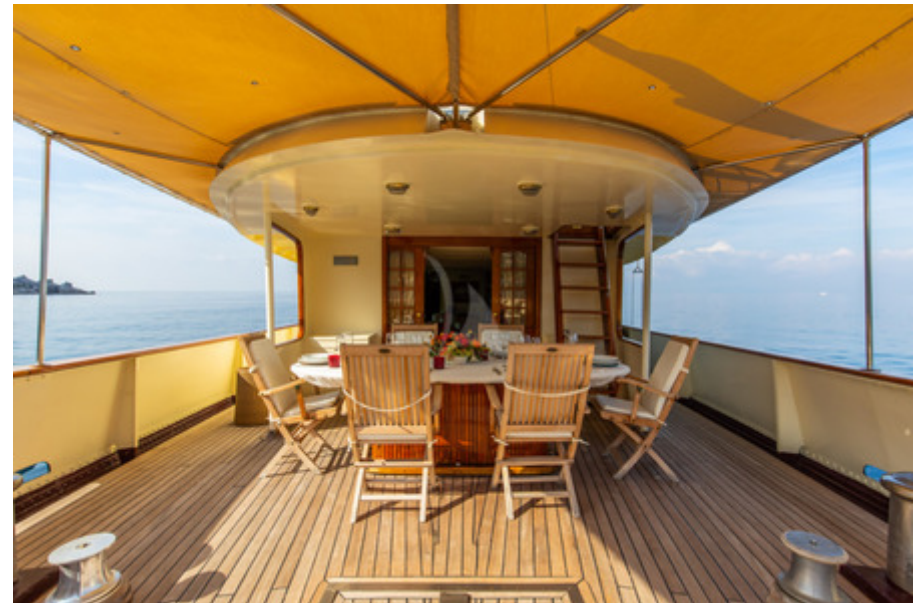
Al fresco area