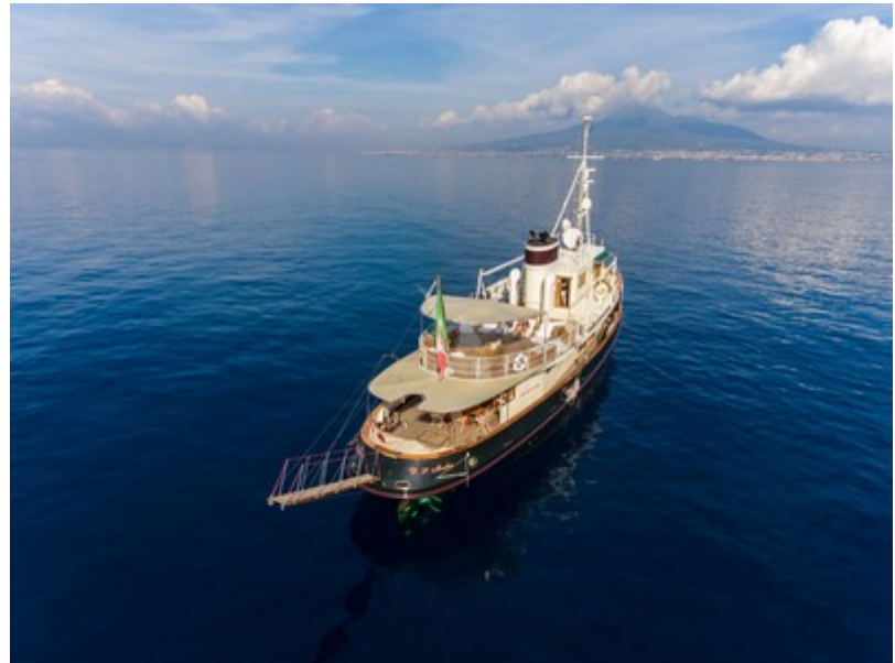
M/Y Dp Monitor