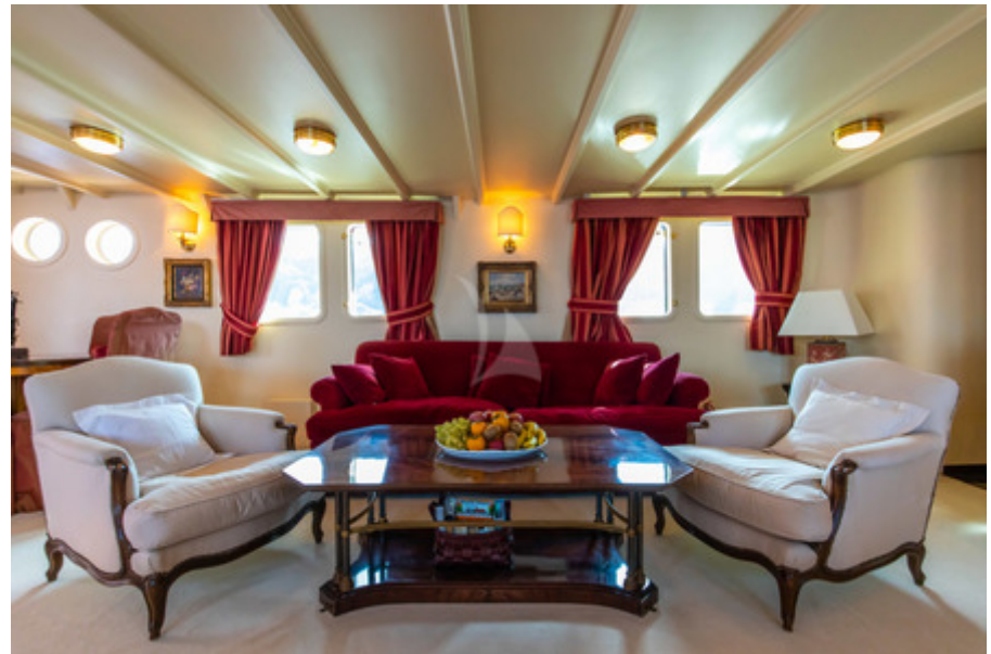
Interior living area