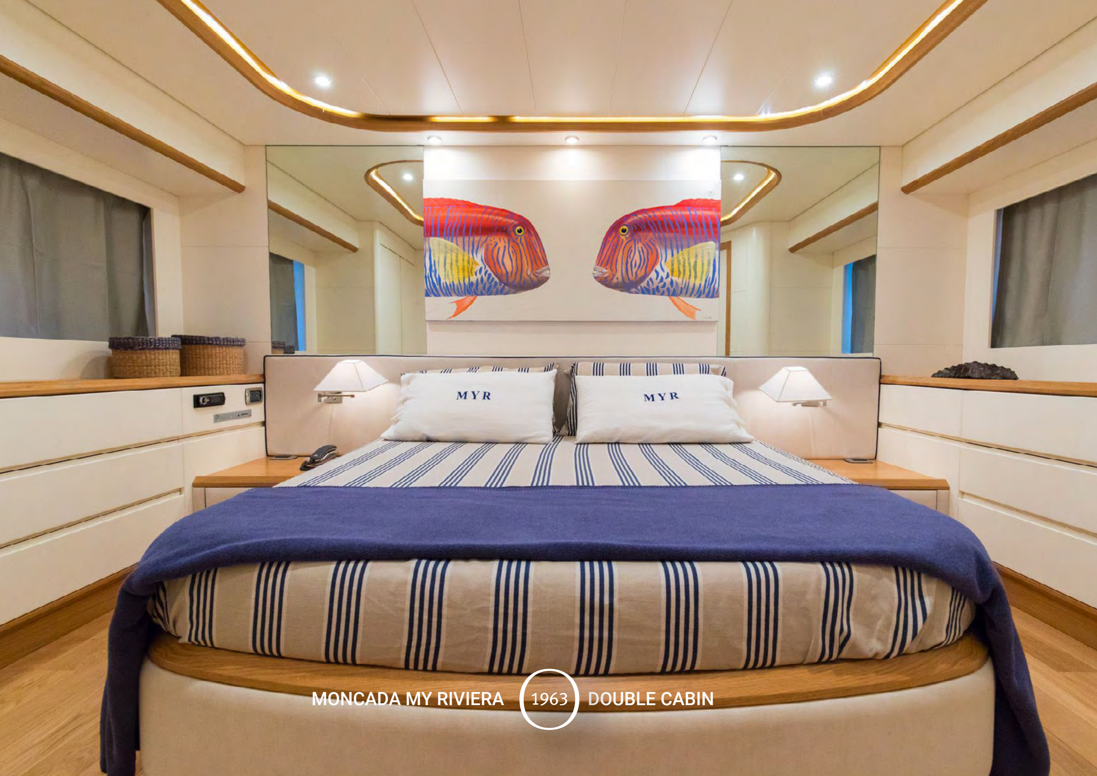
MONCADA MY RIVIERA 1963 DOUBLE CABIN