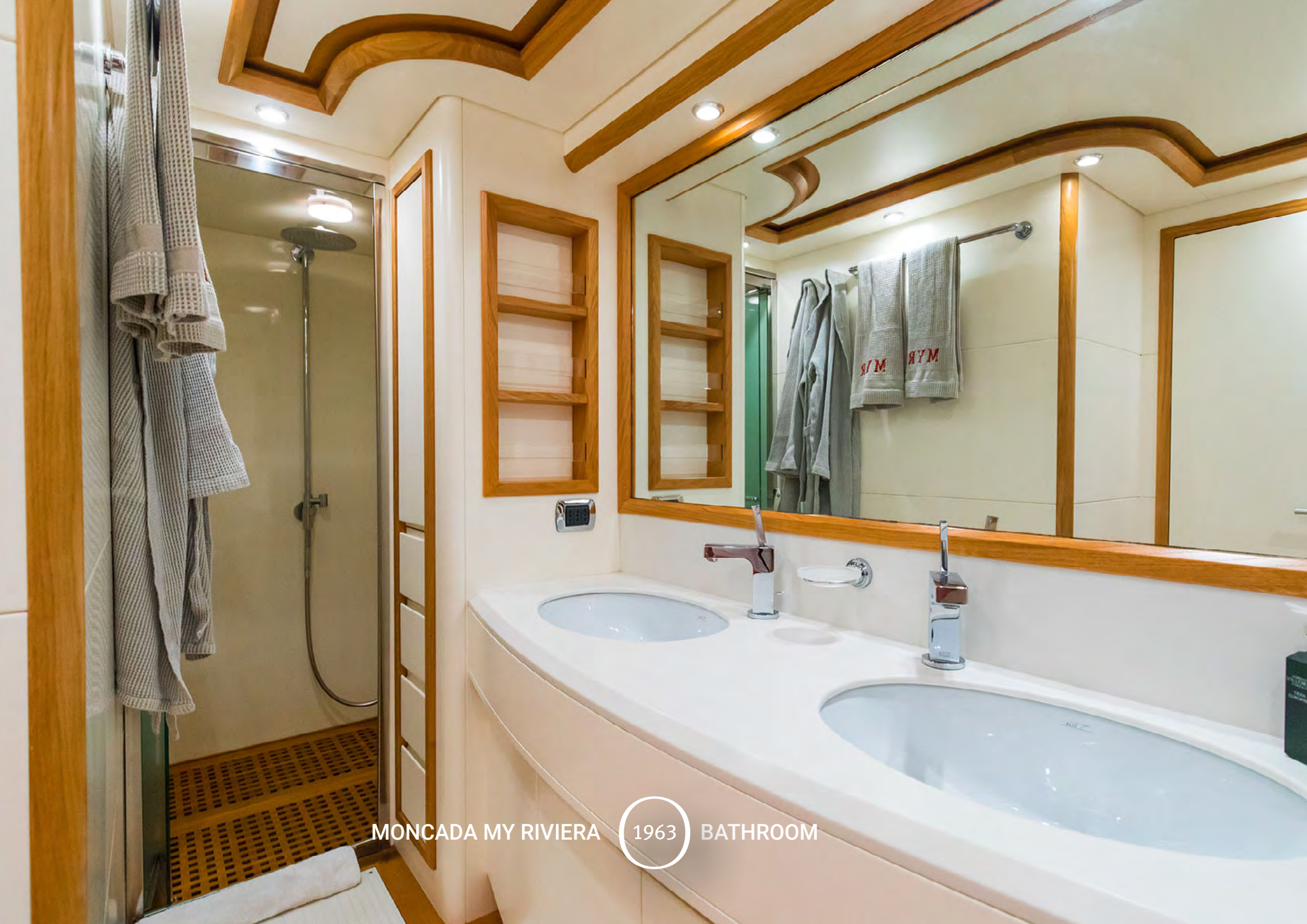
MONCADA MY RIVIERA 1963 BATHROOM